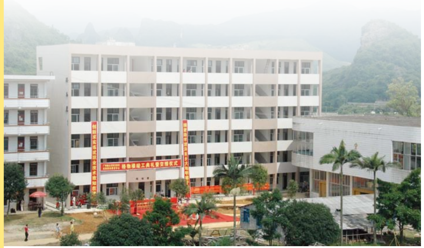
The new student dormitory, Ge Wu Lou, at completion.