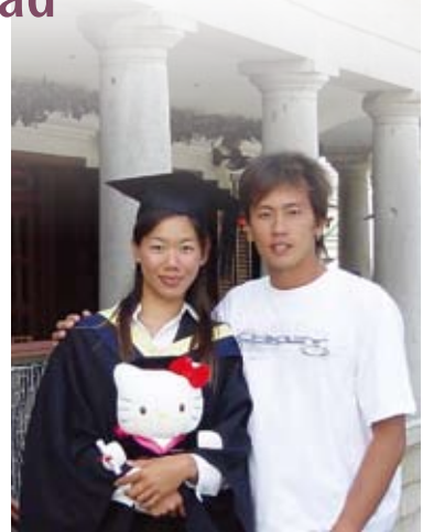
Graduating at HKU