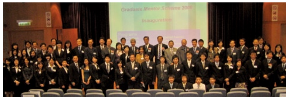
24 brilliant mentors and 37 mentees showed their support at the GMS Inauguration Ceremony on March 15, 2008.

Owing to the success of the first two career talks, HKUEAA GMS conducted the third career talk in April 2008 with special focus on job interview skills and experience. Five fresh engineering graduates were invited to share their recent practical interview experience. There were positive discussions about interviewing skills, speaking manner, dressing code, and career goals.