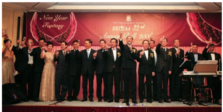
Past Presidents and Honorable Guests of HKUEAA Annual Ball.