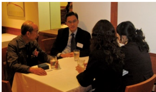
Mentors met their mentees and chatted with each other.