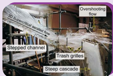
▲ Side view of high velocity air-water flow on Smithfield Road stepped channel and steep cascade

It is commonplace to see stepped channels on steep channels all around Hong Kong. These are constructed to convey storm water flow safely and efficiently into the drainage system. The complex high velocity turbulent flow is three-dimensional and highly aerated. On cut slopes