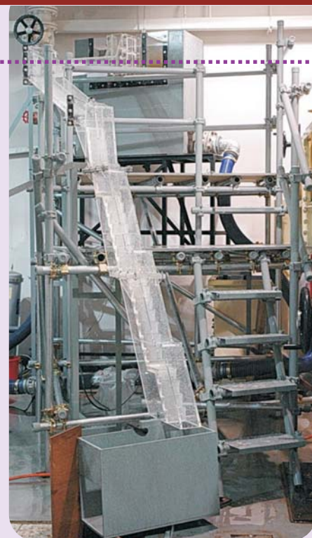
▲ Model of Smithfield stepped channel and steep cascade on man-made slope

The study revealed that the flooding is caused by the sharp bend as well as the position and geometry of the trash grilles – which together cause significant obstruction of the high velocity supercritical flow (at 9 m/s down the slope!). Having identified the causes of the problem, simple and practical solutions have been jointly developed with DSD engineers. It is found that the flooding can be effectively prevented by strategic relocation and re-design of the trash grilles and suitable channel modification. The drainage improvements have been implemented on site and successfully put to the test during a black rainstorm at end of April 2006 – thus protecting Smithfield and the Island West areas from potential urban flooding. Further comprehensive basic research is under way to develop reliable general design guidelines for such unique urban flooding problems resulting from intense urbanization.