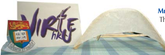
▲ The model made by HKU with self-weight of 27g

The prize carries special meaning to me as it is the first prize and probably the last one that I can win for HKU, as a final year student. I now wish that the HKU team can do equally well in the competition in the years to come.