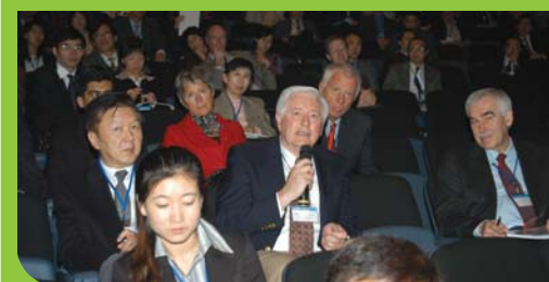
▲ Q&A during a plenary session