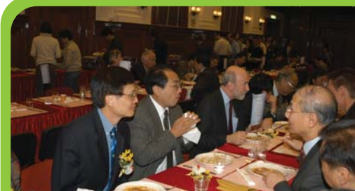
▲ Reception banquet at the Loke Yew Hall

On the technological side, the need to promptly respond to customer's demands has called for new supply chain process models and enabling technologies (e.g. RFID) to achieve greater supply chain visibility and closer collaborations (e.g. information partnership) amongst supply chain partners. Further, in the era of rapid industrial development, green logistics concepts and approaches (e.g. reverse logistics) have emerged to address the host of problems that result. ■