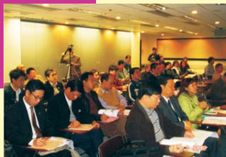
▲ 3rd SMILE-SMC Dissemination Workshop in February 2006

provides access to special tools and plug-ins, e.g. for more efficient "electronic information exchange" with sites and partners, formats for retrieving useful information e.g. in purchasing, materials management; and for benchmarking.