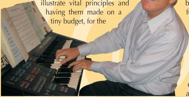
▲ From Vibration and Noise to Applied Acoustics!