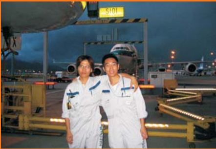
▲ Working in HAECO Line Maintenance during training