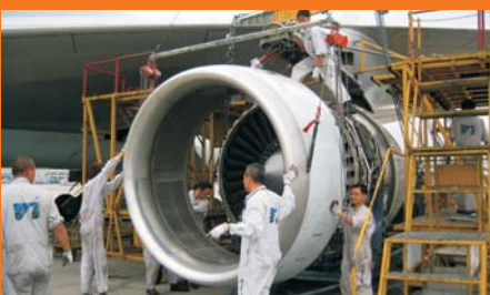
▲ Engine change on a B747-400 Freighter

My first attachment was Engineering Planning, Defect Control Group after I had finished my training programme. I worked as an Assistant Planning Engineer in the group. My main responsibility was to plan the aircraft defect clearance packages and liaise with the concerned parties in HAECO and outstations to get the maintenance jobs done. After one year in Engineering Planning, I was transferred to